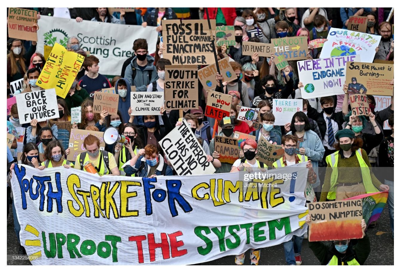
Young people and children participate in the FridaysForFuture Climate Strike, September 24, 2021, Glasgow, Scotland. Other Climate Strikes took place in Stirling, Ullapool and a rally was held outside the Scottish Parliament. In Glasgow their signs state: "Strike for climate." "Uproot the system." "Give back our futures." "Youth strike for climate." "Fossil fuel companies enact mass murder." "We're in the endgame now." "Act now." "Do something you numpties.".

Congress needs to do the math. 28 gigatons of CO2 abatement will cost $28 trillion. Nowhere in the fossil fuel propaganda does the industry provide the total cost.